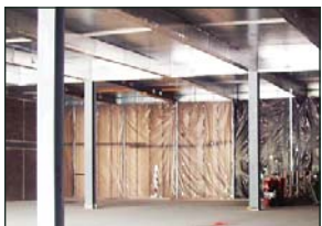
Temporary airtight screens