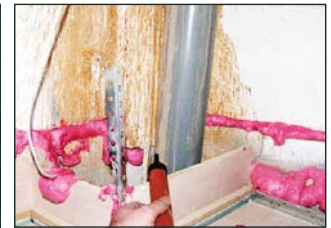
Poor air sealing examples