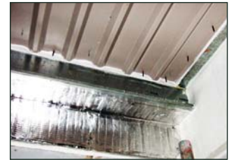
Remedial air sealing examples