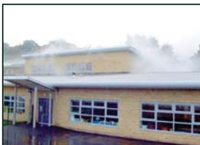
Full building smoke test